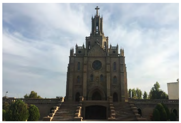
The Sacred Heart Cathedral, a Roman Catholic church in Tashkent.

figure. Nevertheless, it continues to refuse to address the role in the registration process of the mahalla, or local community, which has had discriminatory effects on the ability of non-Muslim religious minorities to register. As part of a religious community's application to register, it must first secure a letter of approval from the mahalla, which can deny approval for any or no reason. In 2018, for example, Jehovah's Witnesses sought the approval of seven mahalla committees for registration but were rejected by each. Some of those mahallas cited their disapproval of the group, claimed that the presence of an ethnic Korean Protestant church in the area precluded the need for Jehovah's Witnesses to register, or said that the presence of Jehovah's Witnesses would lead to divisions and conflicts in their community. Protestant representatives similarly reported that numerous small communities remained unable to register due to either the opposition of the mahalla or other local officials.