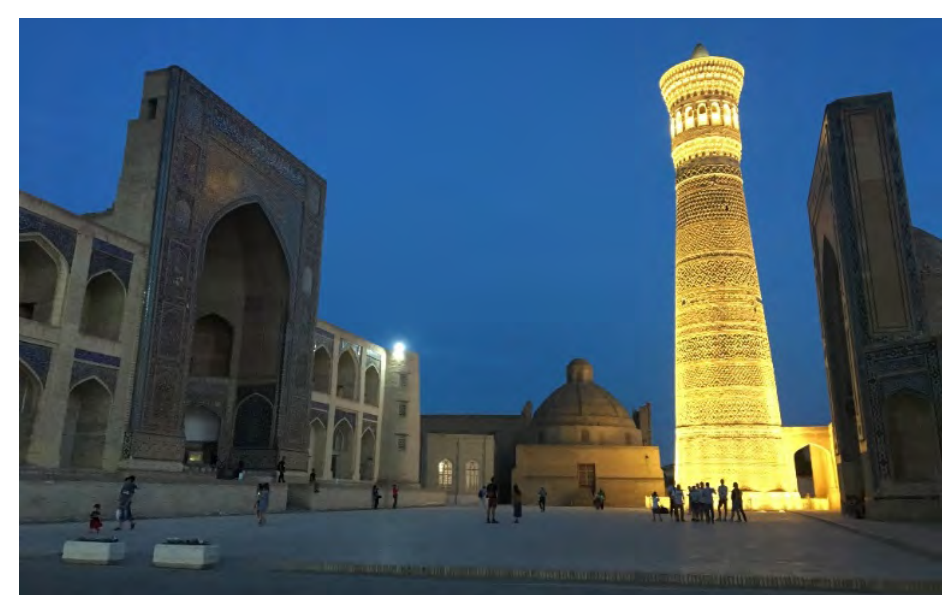
The Kalyan Minaret in Bukhara.